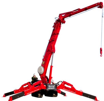
» UNIC URW-706-2