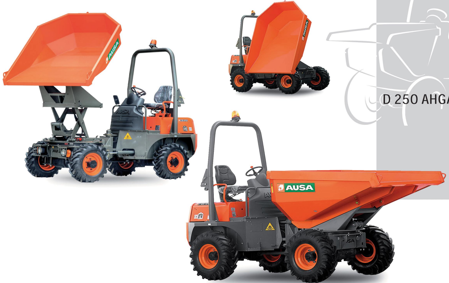
D 250 AHGA