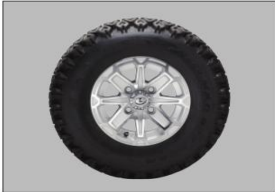
■ Alloy Wheels