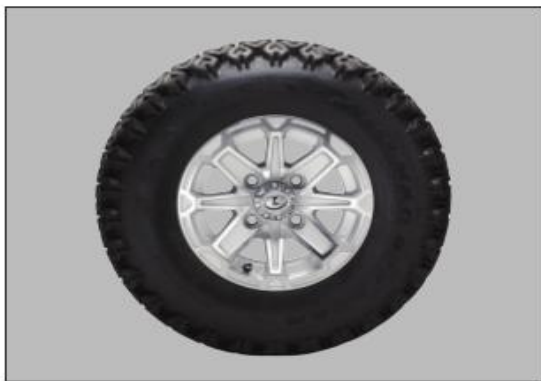
■ Alloy Wheels