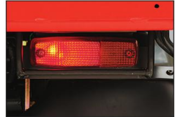
■ Tail Lamp Guard