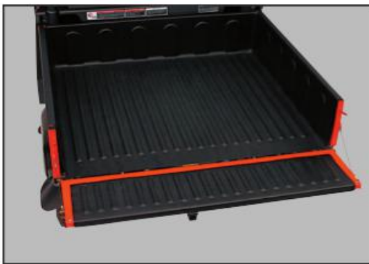
■ Plastic Cargo Bedliner