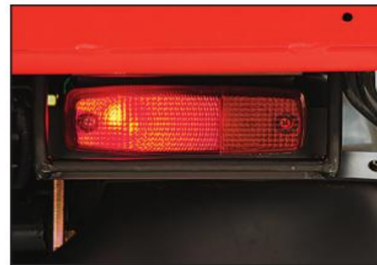
■ Tail Lamp Guard